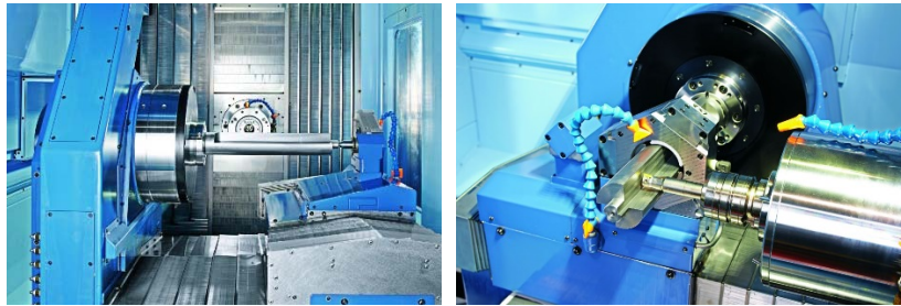
Fig. Application-specific units (Tailstock & Steady rest)